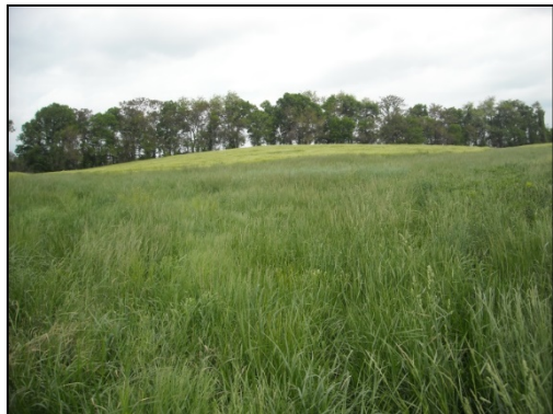
Over 175 acres of open field will be preserved and reforested.