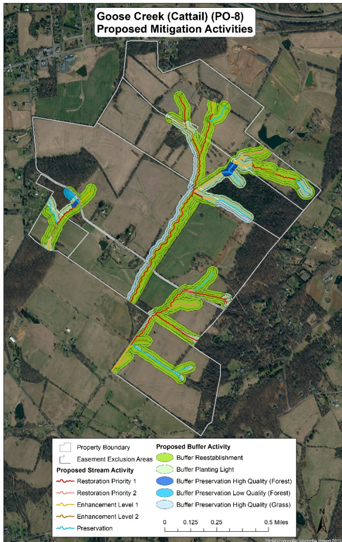
Concept Restoration Plan.