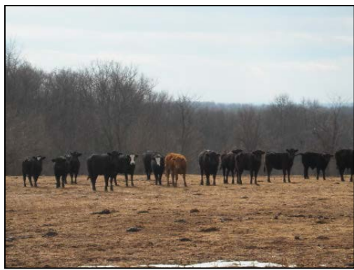
Livestock were removed in 2011.